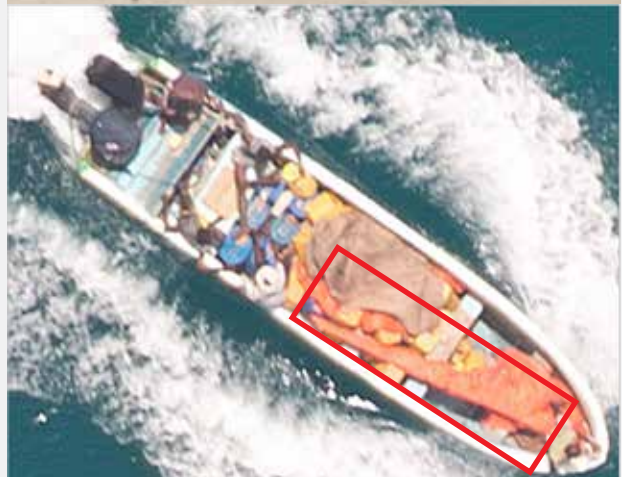
Maritime Patrol & Reconnaissance Aircraft took this image of a pirate skiff in Summer 2013. In the second image the skiff has been deployed to look for target of opportunity. Highlighted in the red box is a 3.5 metre ladder used to board high sided Merchant Vessels, it is clearly visible.