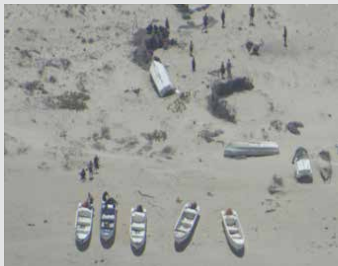
Maritime Patrol & Reconnaissance Aircraft took this image in September 2013. Skiffs are arranged on the beach prior to being put to sea as the Monsoon period comes to an end. Once the wave height reduces and the sea state improves, conditions necessary for operations become more conducive for piracy.