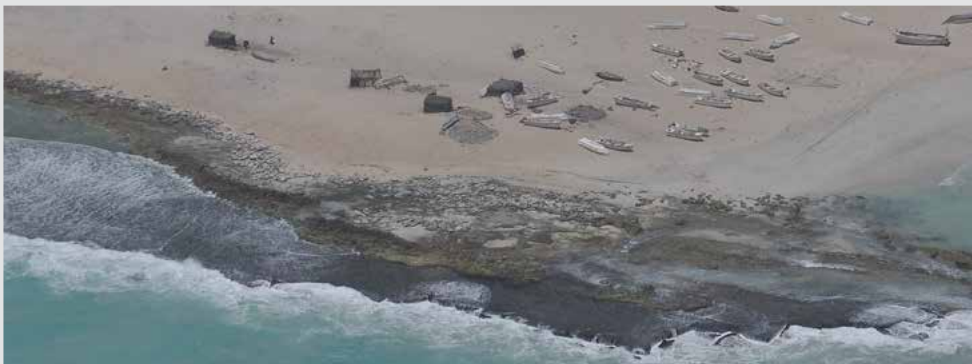
Maritime Patrol & Reconnaissance Aircraft took this image in September 2013. Skiffs are stored in remote locations all along the Somali coast. They can be readied to go to sea at a moment's notice, and frequently deploy during the hours of darkness, using routine maritime activity to conceal their transit.